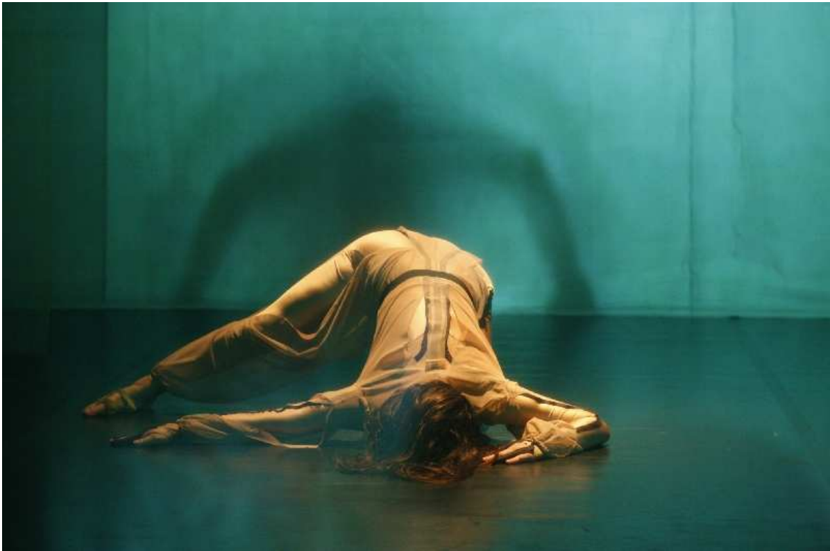
< Marija Ščekić: Human Error. >